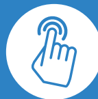
CONFIGURABLE FEATHER-TOUCH PUSHBUTTON