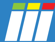
CUSTOMIZABLE COLORED LIGHT INDICATORS

*Microphone patterns include: Omni-Directional, Sub-Cardioid, Cardioid, Super-Cardioid, Hyper-Cardioid, and Bi-Directional